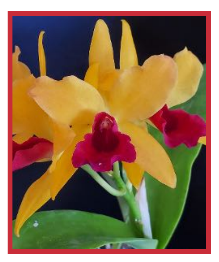
Lc. Gold Digger "Orchid Jungle" HCC/AOS