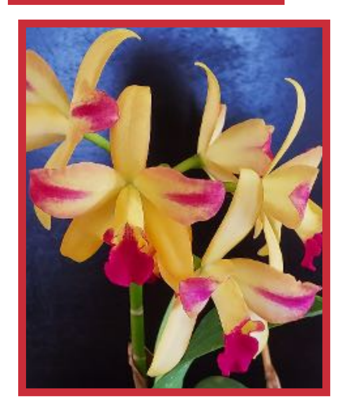
Blc. Laughing Boy