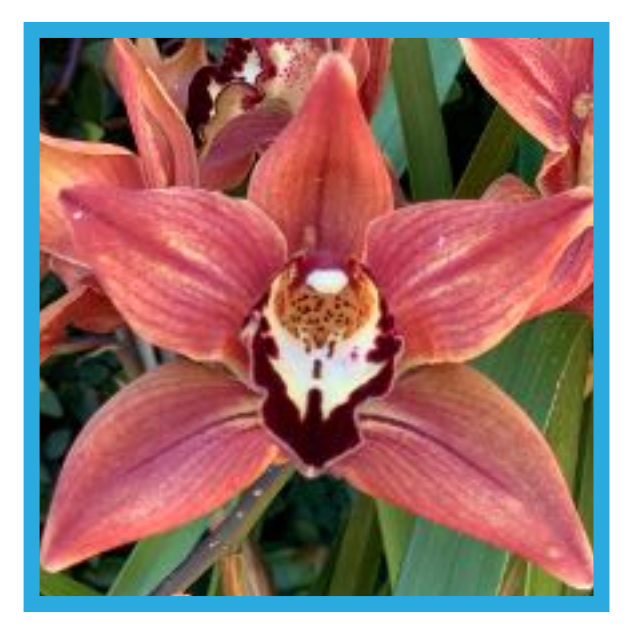
Cym. Persian Bronze 'Barbara' with close up