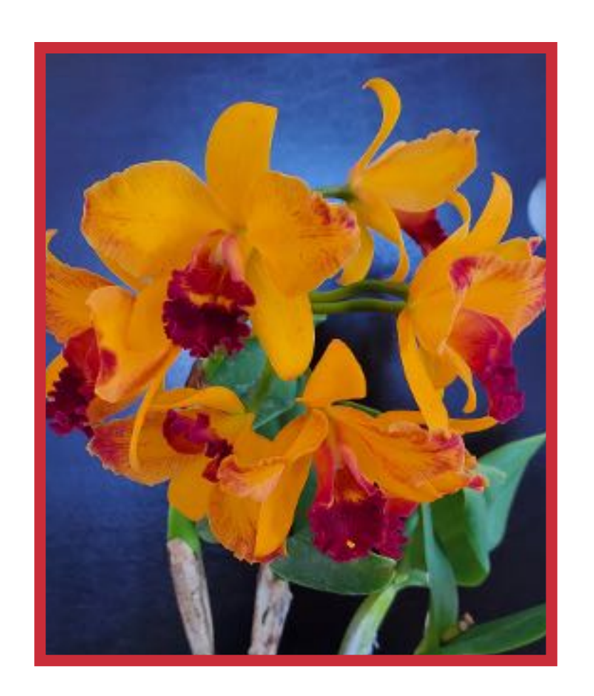
Rth. Big Kiss "15"