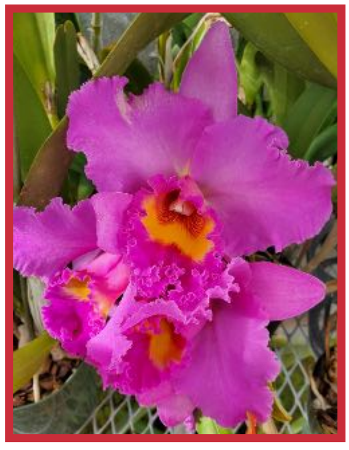
Rlc. Gold n pink (C. Mami Akatsuka 'VQ' x Rlc. Noriko Kawamura 'Yellow')