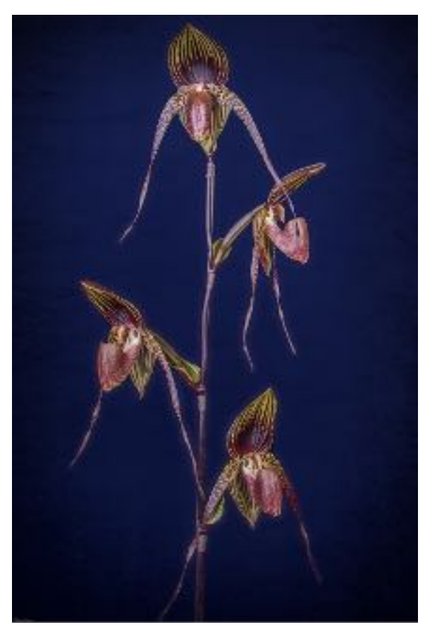
Paph. Johanna Burkhardt 'Suzanne' AM/AOS