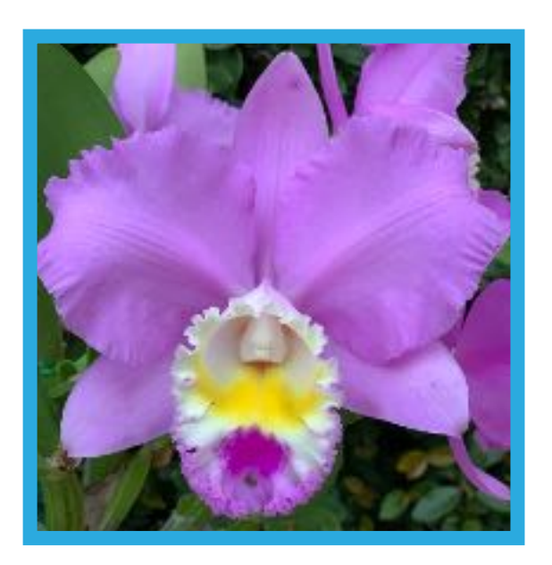
Blc. Mem. Victoria Kam 'Fascination' HCC/AOS with close up