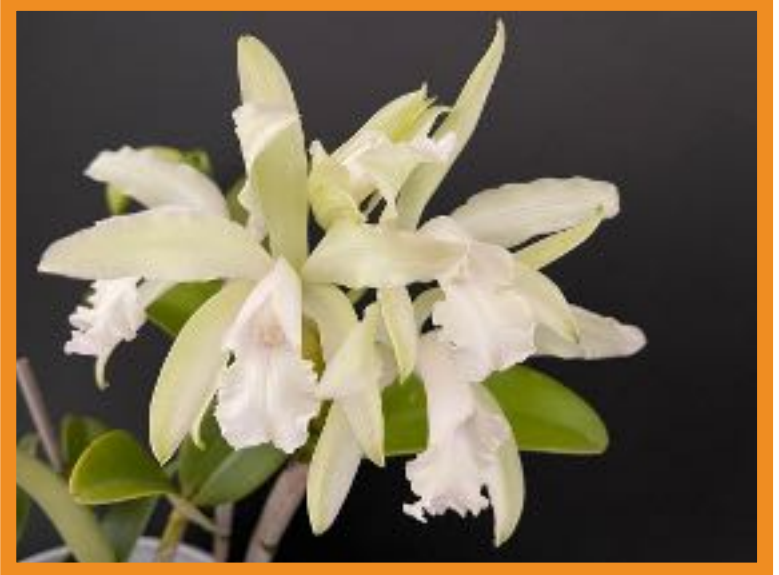
Cattleya intermedia var. alba 'Plema x Hoyts'