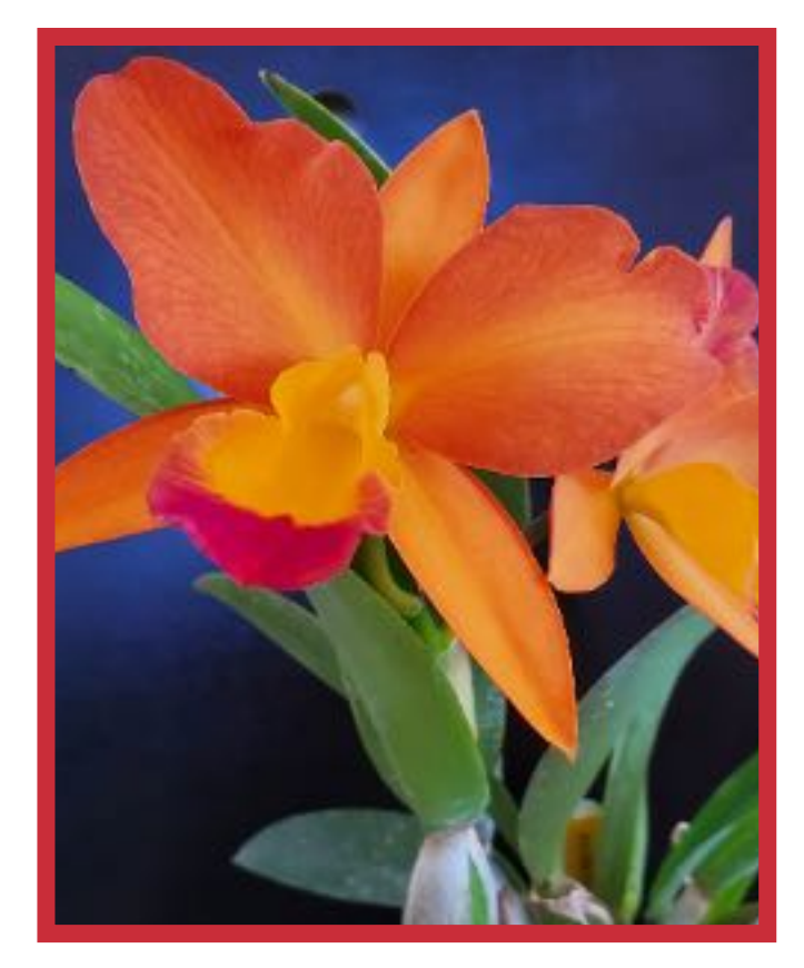
Carolina Orange D'or "Lennette #2" AM/AOS X Lc. Tropical Sunset "Oceans Heaven"