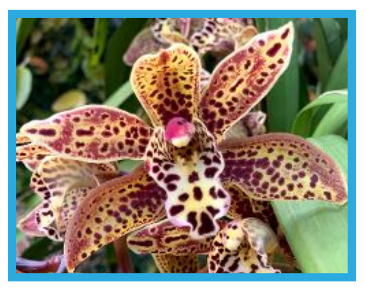
Cym. Speckles 'Bold Vision' JC/AOS with close up