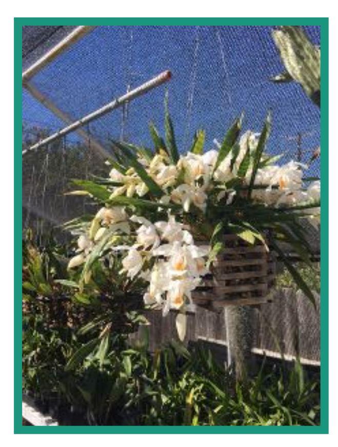
Coel. cristata 'Suwada'