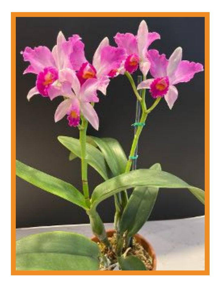
Lc. Angel Heart 'Hihimanu' AM/AOS x Pot. Martha Clarke 'Amazing'