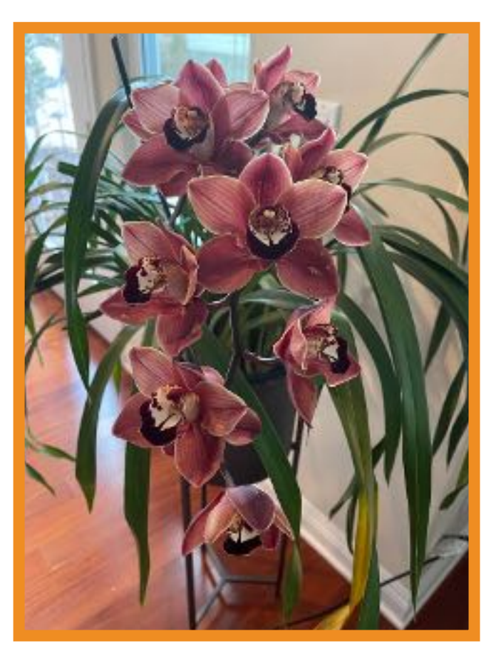
Cym Mighty Remus 'Cabernet'