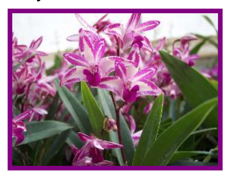
Den. King Zip 'Red Splash'