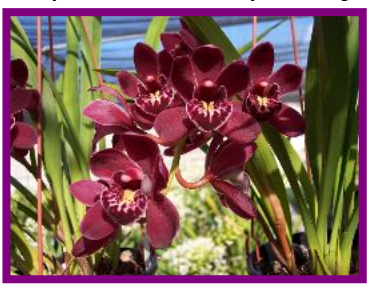
Cym. Ruby Eyes 'Red Baron'