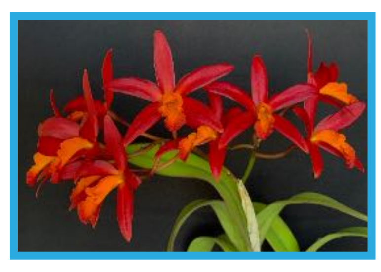
Lc. Koolau Treat