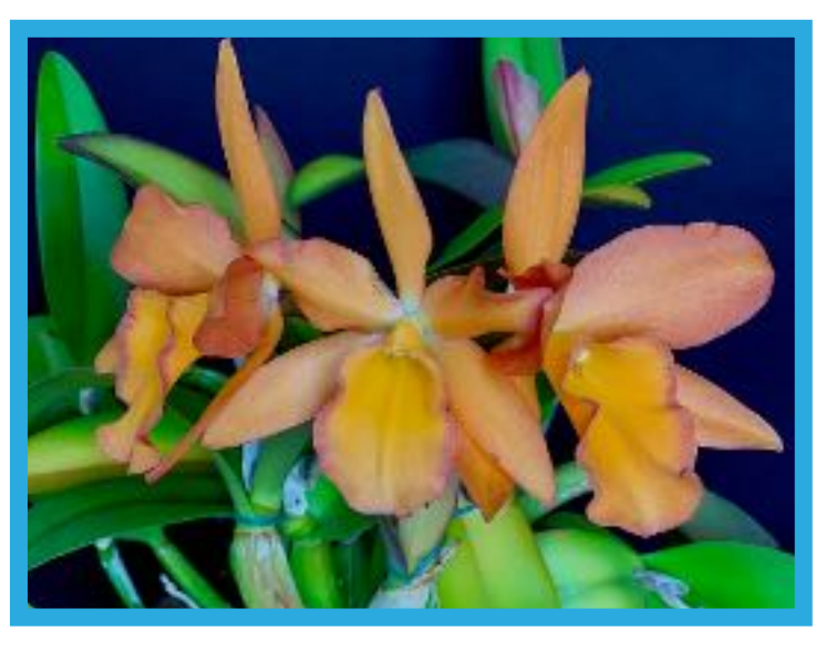
AMN-061: Blc. Fuchs Orange Nugget 'Lea' x B. glauca