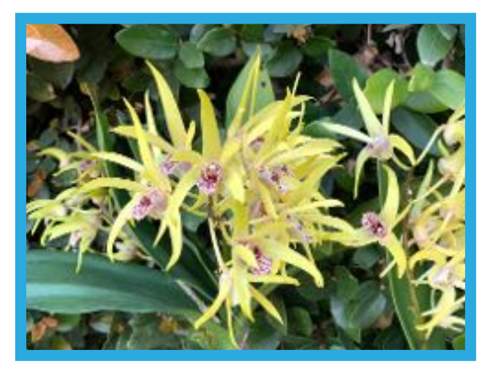
SVO5300: Den. Regal Vista