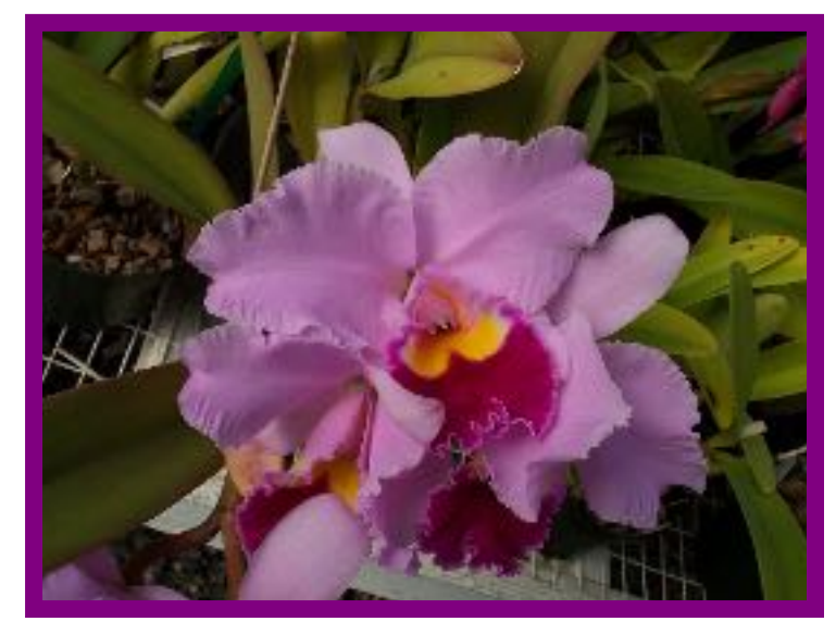
Blc. Temple Bells X Blc. Calm Seas