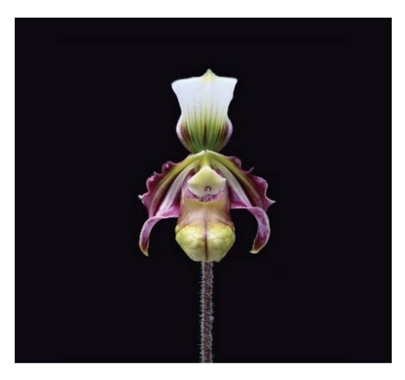
Paph. sangii 'Haley Suzanne' AM/AOS