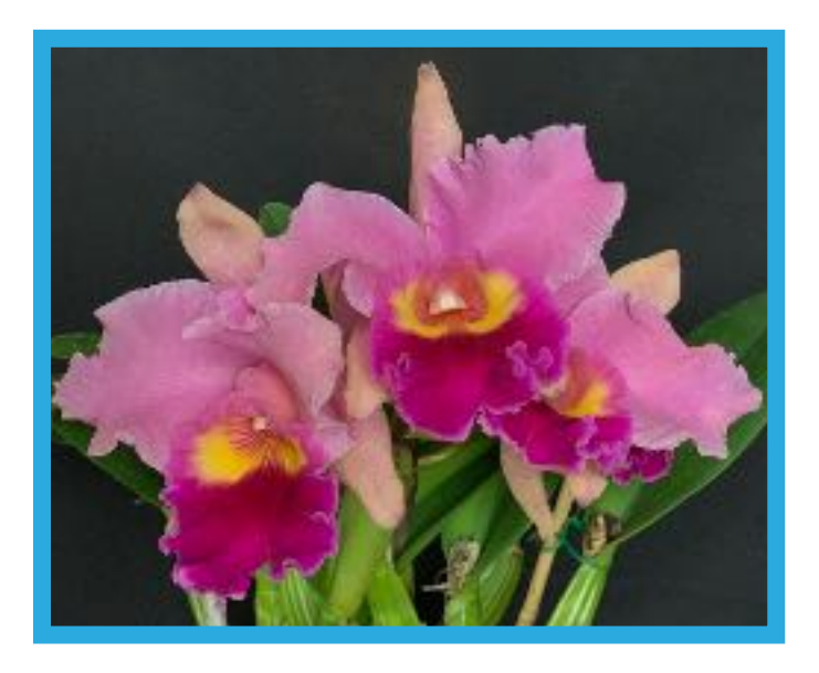
Lc. Recondita Armonia 'C'