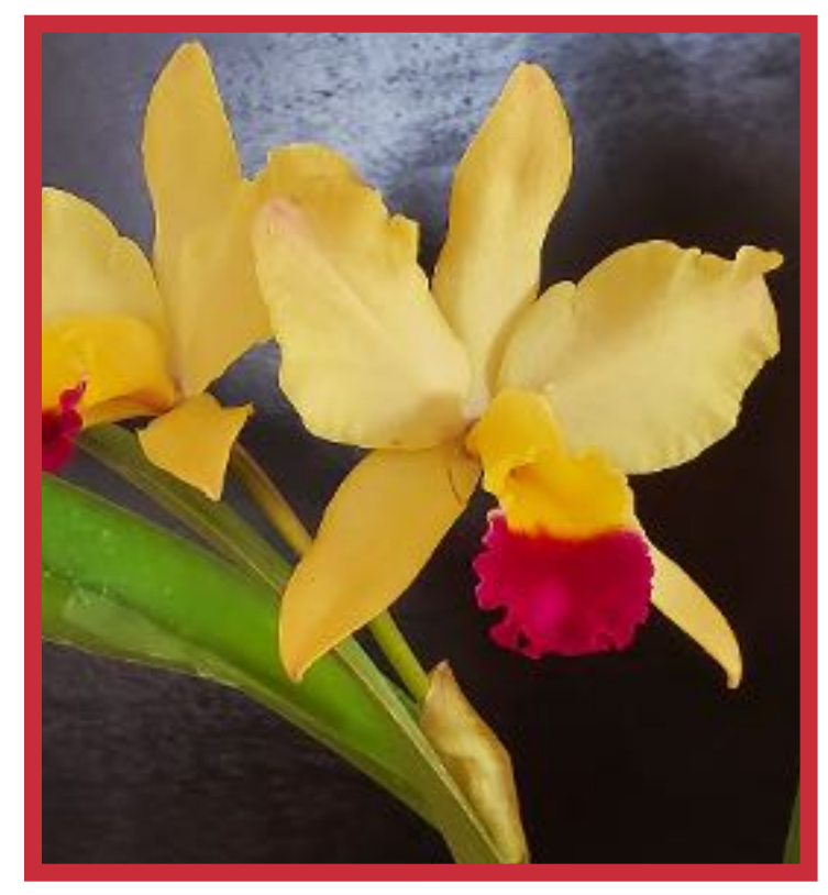
Pot. Tropical Sunset "Oceans Heaven" x Lc. Tokyo Magic "6-1" AM/AOS