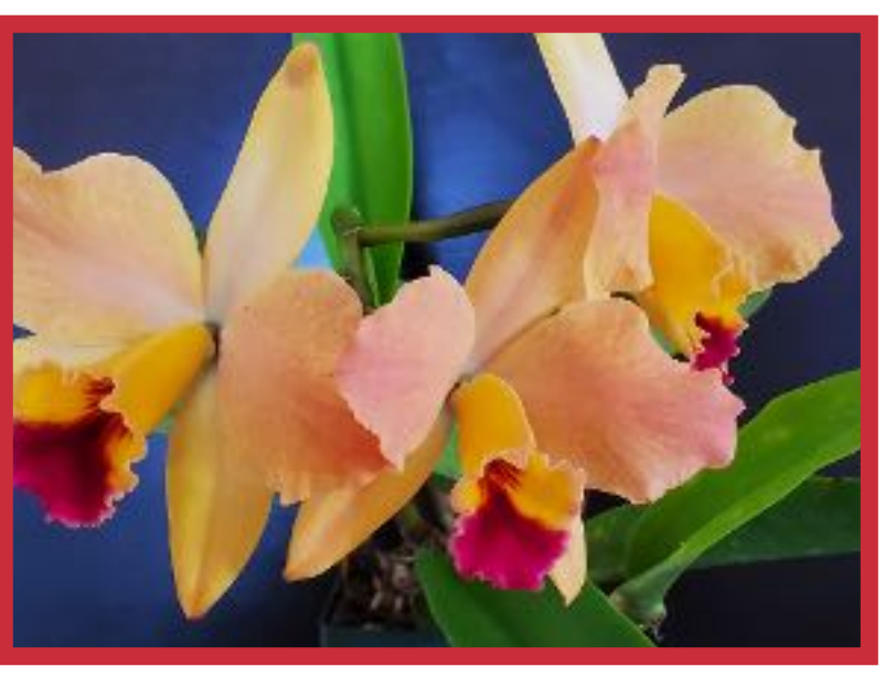
Pot. Georgia Peach "Excellent" X Pot. Fire House "Love It"