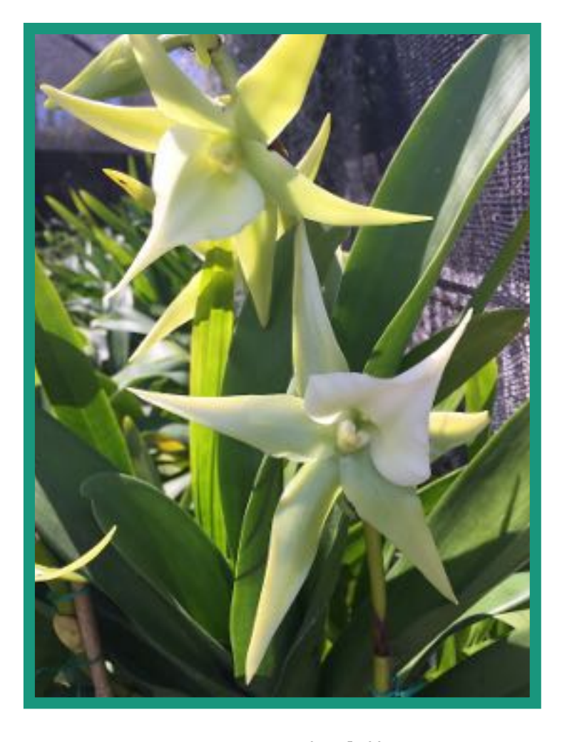
Angcm. Veitchii (sesquipedale x eburnum)