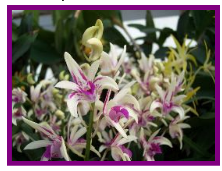
Den. Gillieston Jazz X Den. speciosum