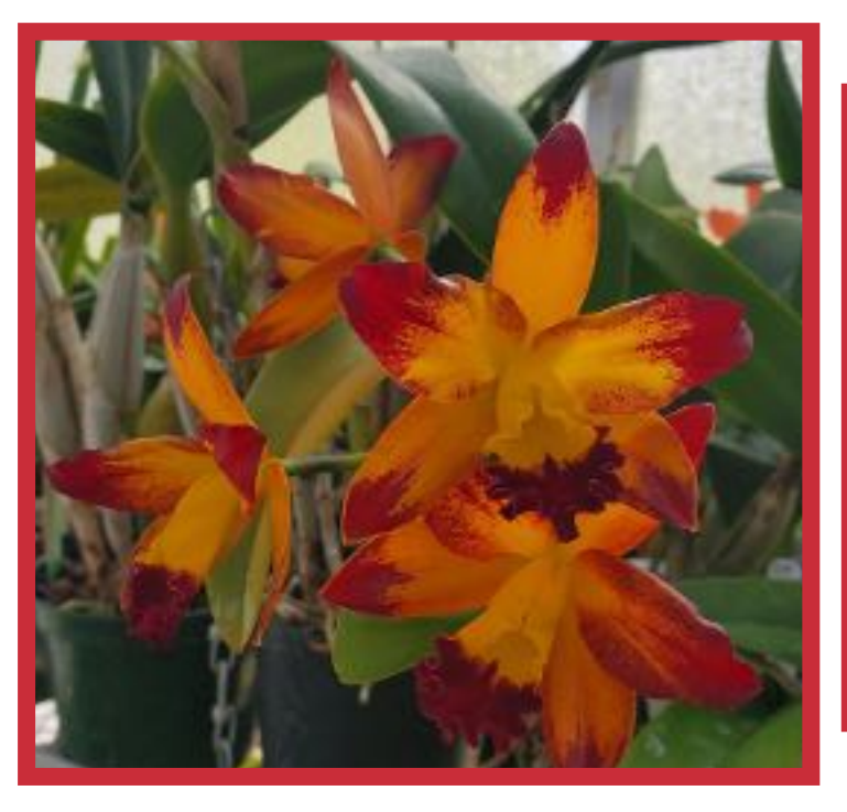
Ctt. Varut Startrack "CS"