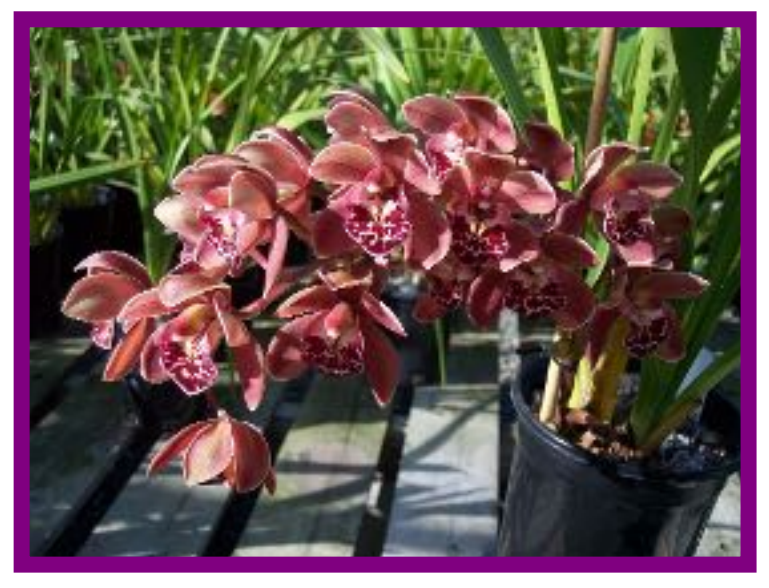
Cym. Death by Chocolate