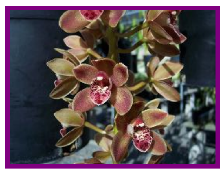
Cym. Bulbarrow 'Waikanie'