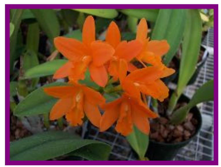
Blc. Young-Min Orange 'Golden Satisfaction'