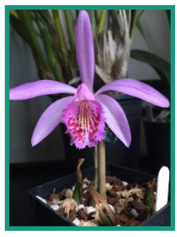
Pleione Hekla x yunnanense