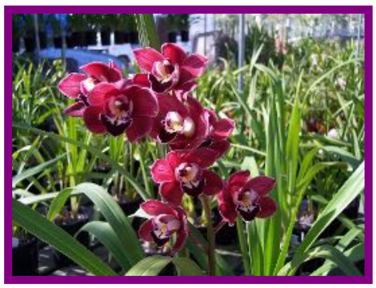
Cym. Black Silk 'Early Evening'